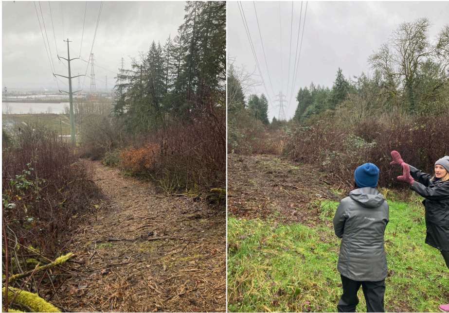
FPC staff viewing the area under the existing PGE transmission line where previous clearcutting had occurred.