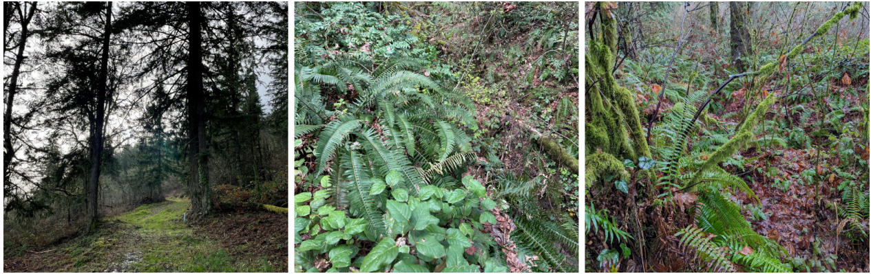
Images taken from the proposed work area.