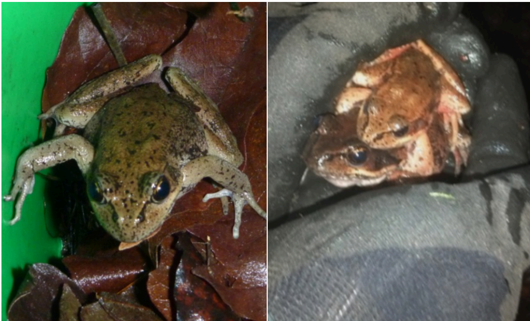
The northern red-legged frog, a federally recognized species of concern that is listed as “Sensitive” in the state of Oregon. Images taken during the 2015 “frog shuttle” effort .